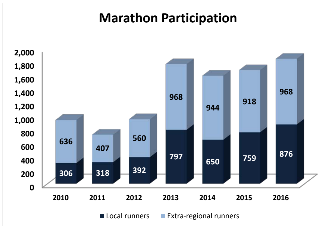
Figure 2: Marathon Series Participation by Year

Overall participation was comparable to last year with roughly 9.96 percent more runners overall. Extra-regional runners which introduce new money into our region by spending on goods and services surrounding the day of the event increased by 5.4 percent over last year. Utilizing the runner registration list, it was determined that 52.5 percent of participants originated from outside the study area and were therefore counted as visitors in the analysis. Those originating from outside of the MSA were divided into those who were likely to have made a day-trip out of running in the marathon and those who were likely to have spent the night based upon the distance traveled to attend. Generally, those traveling one and a half hours or more were classified as having spent the night. Generally, survey results supported this classification with the majority of runners from one and a half hours or more indicating some hotel