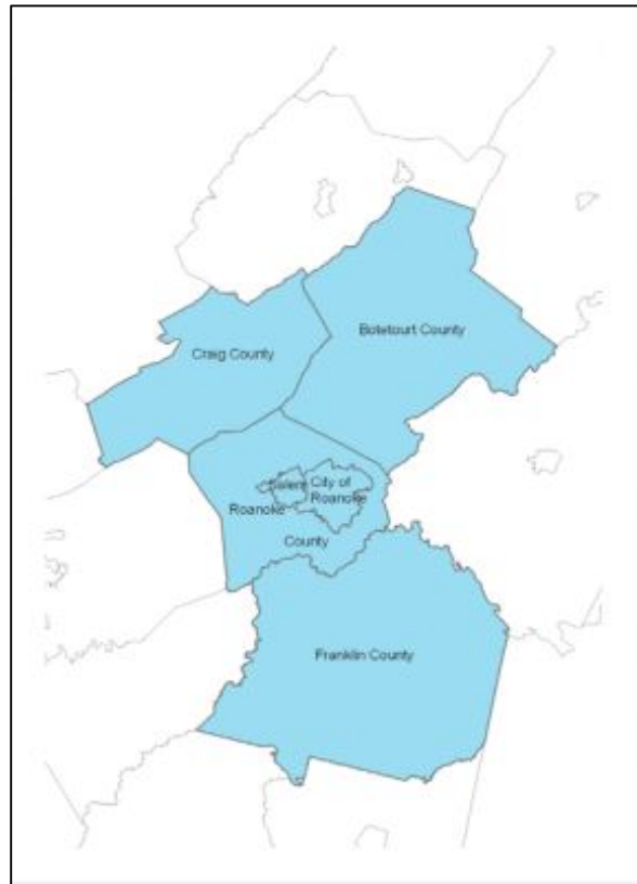
Figure 1: Study Area Location

IMPLAN is an economic impact modeling software first developed jointly by the University of Minnesota and the US Forest Service in the 1970's and later expanded upon by the Minnesota IMPLAN Group. The modeling software and IMPLAN proprietary data set is currently maintained by IMPLAN Group, LLC, a private company based in Huntersville, North Carolina. IMPLAN is widely used by universities, economic consultants, economic development professionals, and others involved in estimating economic impact of